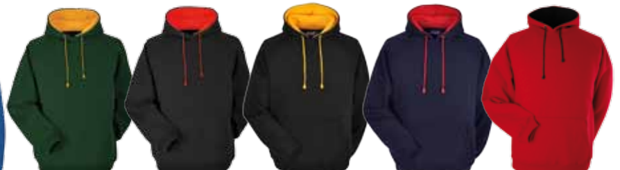
Bottle/gold Black/red Black/gold Navy/red Red/black