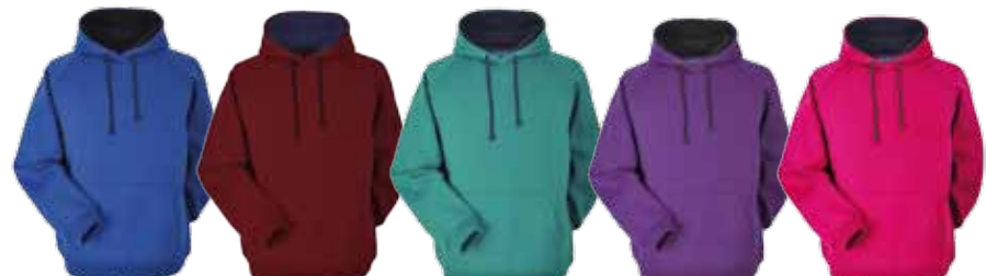
Royal/navy Wine/navy Teal/navy Purple/black Fuschia/navy