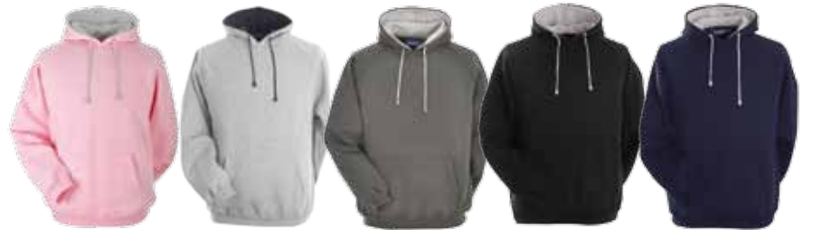
Soft pink/grey marl Grey marl/navy Titanium/grey marl Black/grey marl Navy/grey marl