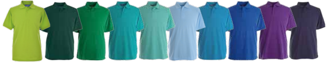
Lime Bottle* Emerald Jade Mint Sky* Cyan Royal* Purple Navy*