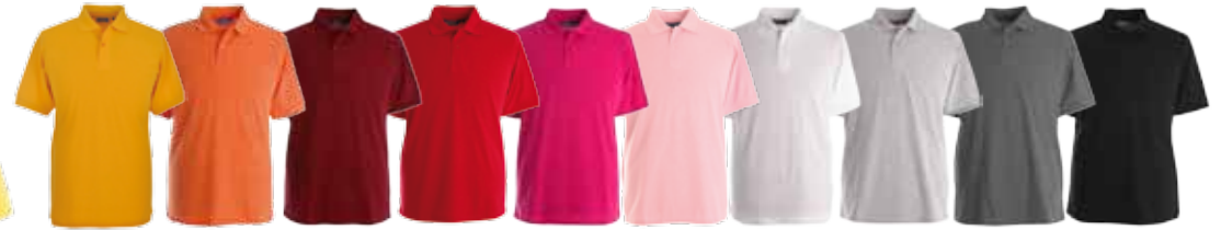
Gold* Tangerine Wine* Red* Fuschia Soft Pink White* Grey Marl Dark Grey Black*